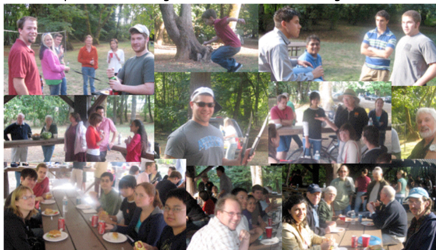
Collage from the Fall Department picnic to welcome new students and kick off the year. In case you can join us, the fall 2008 picnic is tentatively set for Sunday September 28 th .