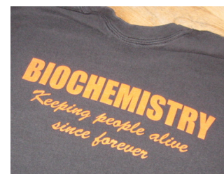
Spring 09 BB club T-shirt

Research to reveal the basic mechanisms of life and interacting with students to spark in the next generation a sense of wonder and excitement about how life works are exactly what we are about. We have great students who are catching that sense of wonder and excitement and gaining the knowledge to be the leaders of tomorrow. Our undergraduate BB-club this year created a delightful T-shirt (shown to the right) that captures how important we see our discipline. I first wore the shirt at a conference in Portland, and got offers from three people wanting to buy it off of my back!