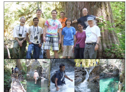
The BB-excursion in August to Opal Creek